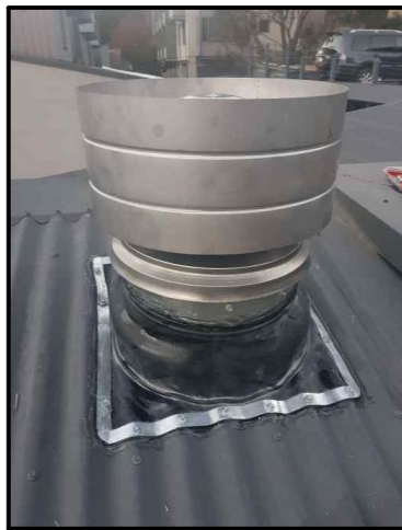
UNIT 6 FLUE SIDE VIEW